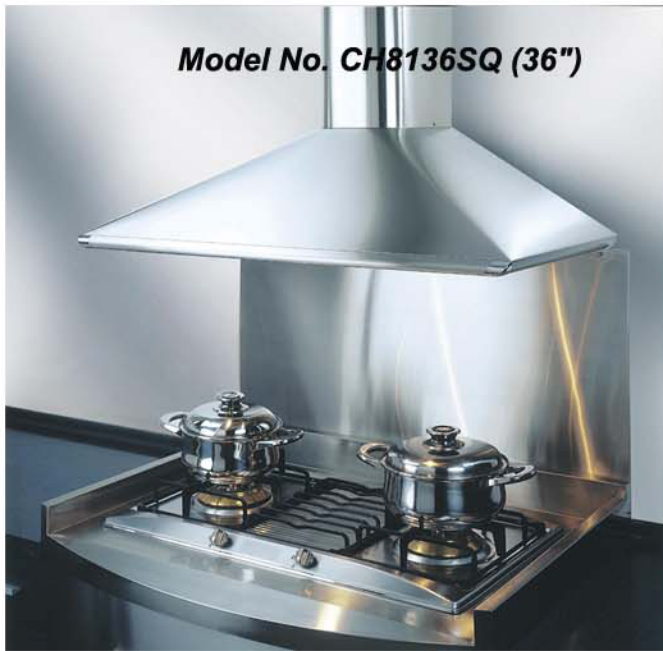
Model No. CH8136SQ (36")